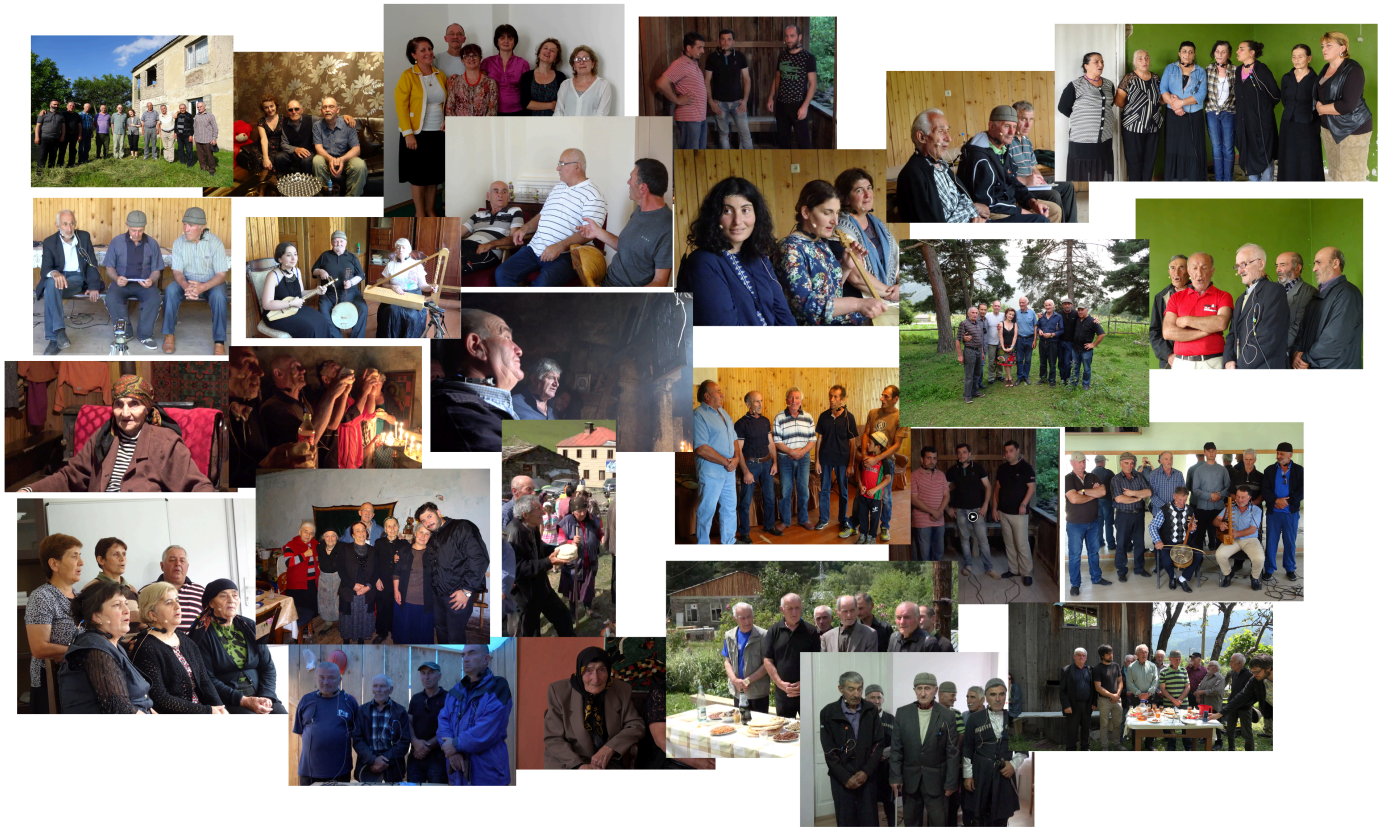
Figure 2. Collage of the recorded singers.

Figure 2 show a collage of the recorded singers. Photographs from the individual recordings sessions can be found with the additional material provided in the archive.