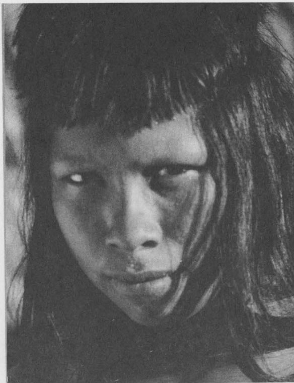
Kraho-girl with typical haircut. Kraho live on the wide plains of the left shore of the Tocantins, in the Brazilian states of Goias and Maranhao. They are the "singing Indians of Brazil."

Juruna-Indians - A small group, consisting of several families and not exceeding seventy or eighty Indians live still in four houses at the upper Shingoo-River in Central Brazil. Only a few songs could be recorded by the author. It seems that the way of singing by the Juruna differs somewhat from other Indians of the same region. Some of the recorded choirs are accomplished by men and women, singing in a reversal sequence. No choir-conductor was present or mentioned, nor any instrument to mark the rhythm, which was done by pounding powerful their legs to the ground or by clasping loudly their hands. All songs performed seemed to be of exclusive social character - the pure pleasure of singing. Juruna-Indians are known for their extensive and intensive