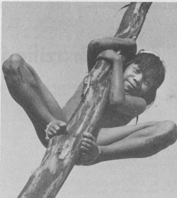
Kraho boy climbing a pole. Kraho love singing. They have women's, men's and youth choirs. Every morning and night they gather on the village square to sing to the rising sun and dwindling day.

Kraho-Indians - About fourhundred and fifty Kraho-Indians live in four villages in the wide and open savannah of northeastern Brazil, a few hundred miles from the shores of the Tocantins river, an amazonian tributary. The Kraho belong to the Je-speaking Indians of Brazil, who are by far the most musical and music-loving of all Brazilian Indians. Every morning before sunrise, one of the beloved and famed choir-conductors starts a dance