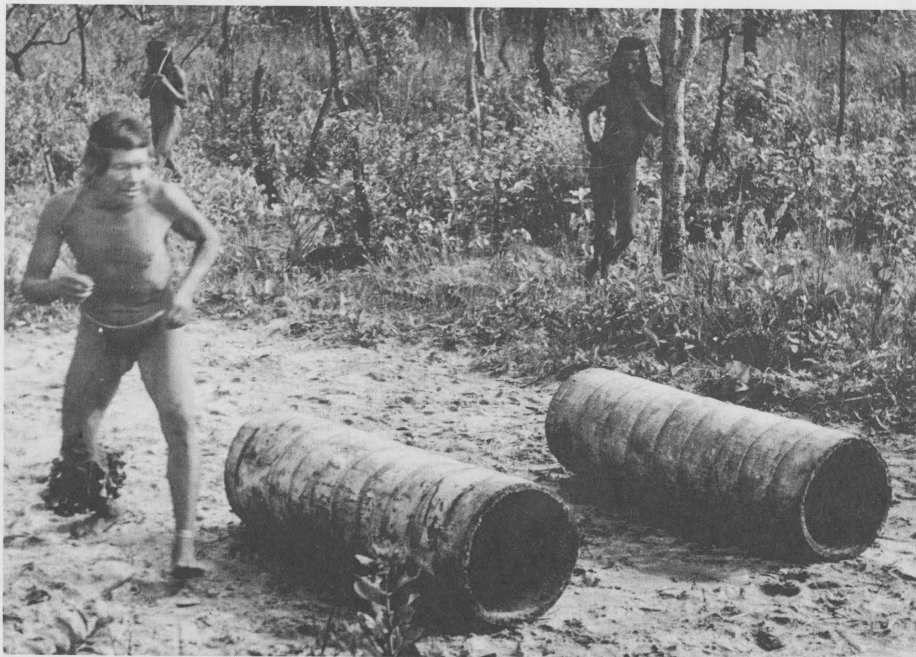
Kraho ceremonial leader sings old songs invoking spirits into both hollow logs, which represent souls of deceased Kraho. Later both logs are carried during a fast relay race by two parties of young Indian men into villages.