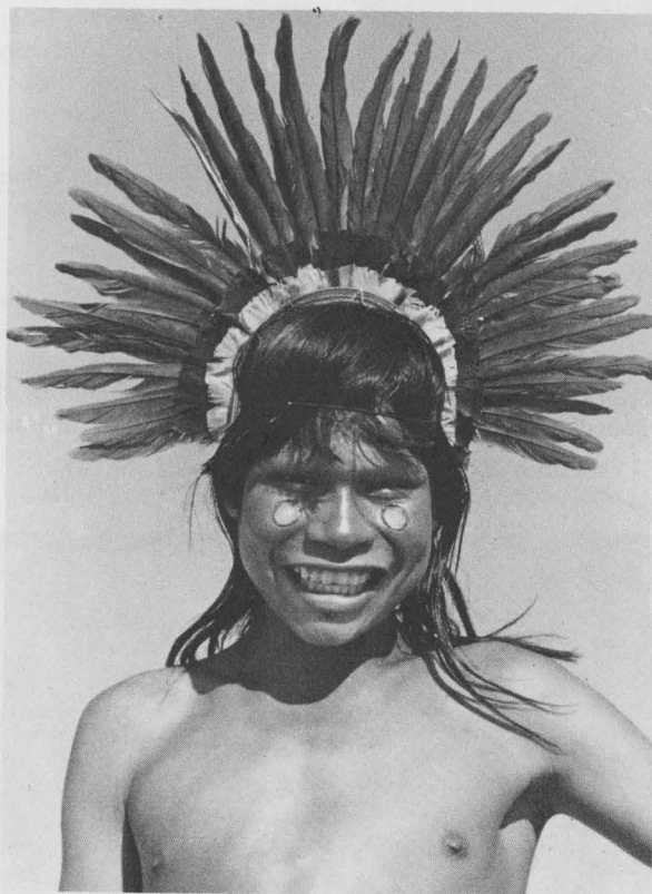
Karaja-Indian with parrot-feather head-crown. Two circular scars in both sides of face are tribal mark. Karaja live on the huge beaches of Araguaia River in Central Brazil.

Karaja-Indians - About eighthundred Karaja-Indians still live on the shores of the Bananal-Island, Araguaia-River, in Central Brazil. They have been in peaceful contact with our Civilisation since more than a century, but maintain, in spite of, a high level of their old traditions. During the dry season, from May to October, they erect summer-villages of light straw houses on the immense beaches of white, soft and hot sand, performing every afternoon and night their sacred fertility rites, with colorful masks of feather heads and straw skirts. During these dances they sing old songs of their ancestors, but also new compositions appear from time to time and are traded from one village to another. These 'Aruana' masks are stored in special sacred mask-houses far from the row of village houses and are