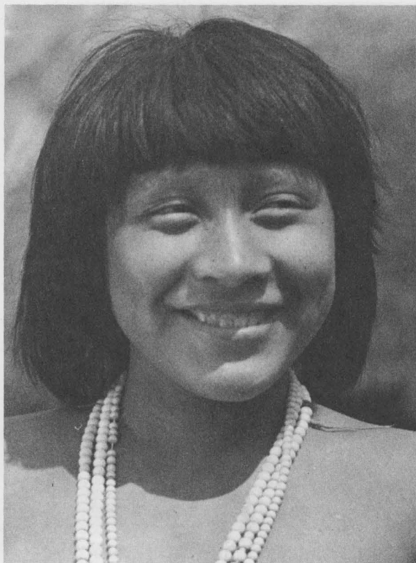
Suya-Indian girl of about fifteen. Glassbead necklace given by the photographer.